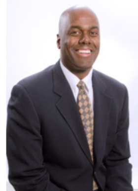
Executive Staff Image Library